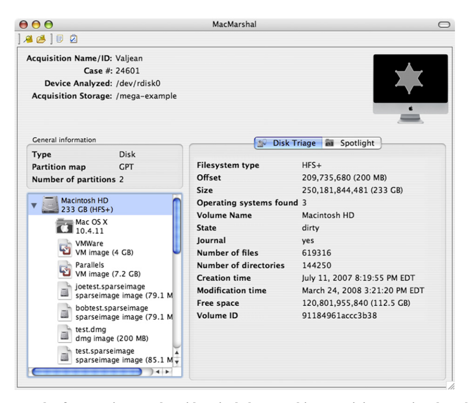
Fig. 2 – Example of MEGA triage results with a single-boot machine containing two virtual machines.

text-based files, a feature formerly available through Search Kit in OS X 10.3. The behavior of these two capabilities differs slightly from the behavior of other Spotlight metadata, despite being integrated into Spotlight.